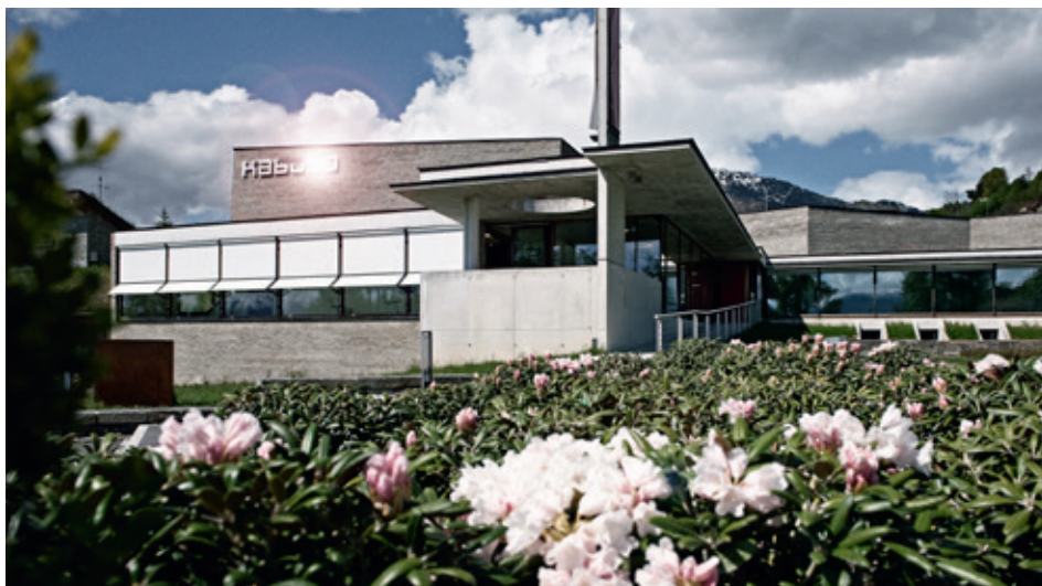
Kabuso Art Centre in Øystese, Hardanger

The competitors who do not enter the second round of the competition will be given the opportunity to give a concert tour in the surrounding region under the auspices of Hordaland county. Accompanied by local guides, these eminent pianists will give concerts at these venues: